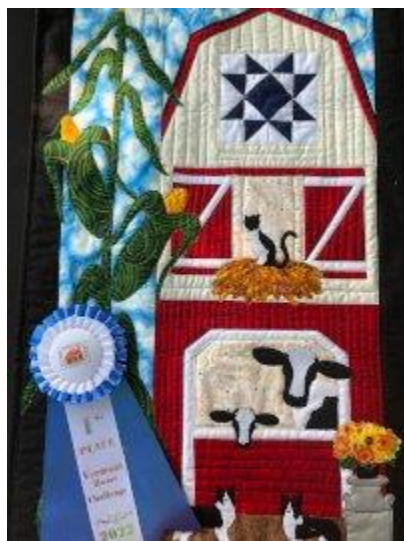
Franklin County Quilt Show

Food: Coffee shops and restaurants are within walking distance of City Hall.