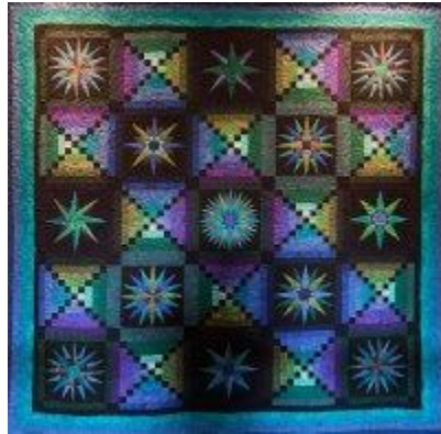
Maple Leaf Quilters 2023 Raffle Quilt

Food: Tea Room with snacks available at the show