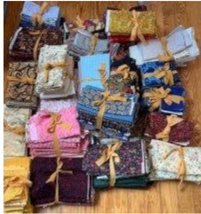
Quinobequin Quilters Auction

Food: Variety of restaurants located 1/4 mile from event location on Great Plain Ave. in Needham Center